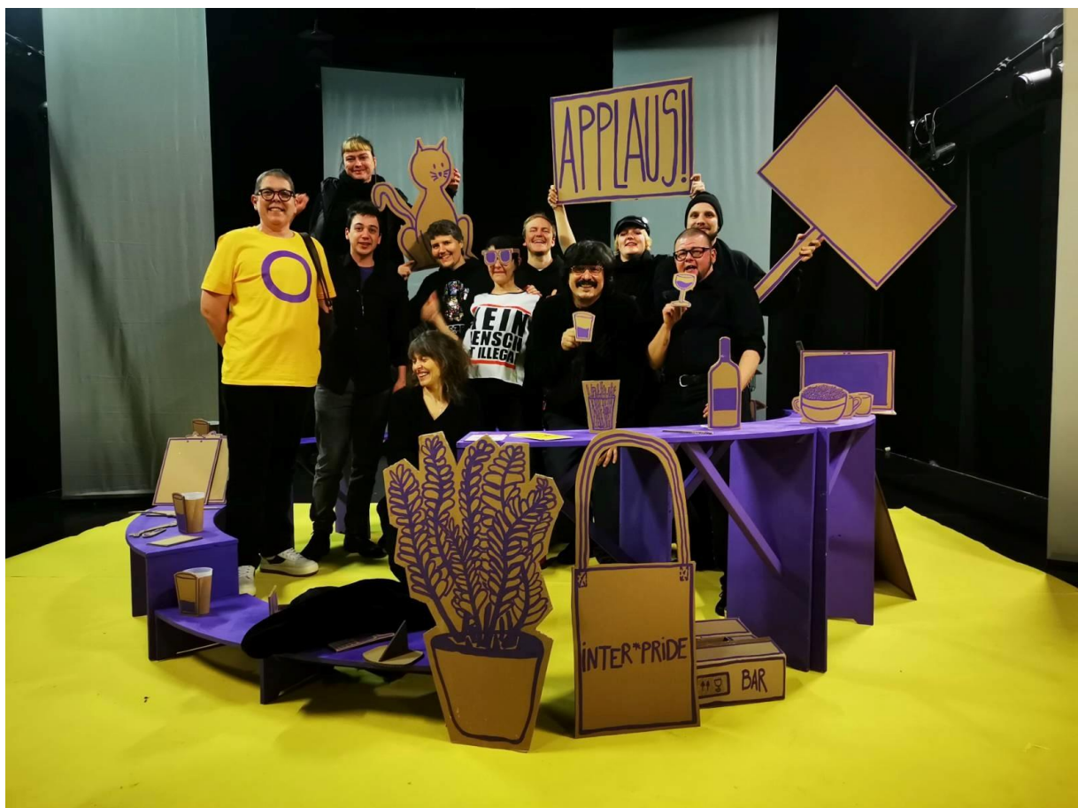
the whole crew behind the play "INTER*Story - a piece of activism" at the Dernière WERK X-Petersplatz on 26.11.2022

2022 was a very creative and varied year at VIMÖ and VIMÖ Vienna and our counseling center VarGes!